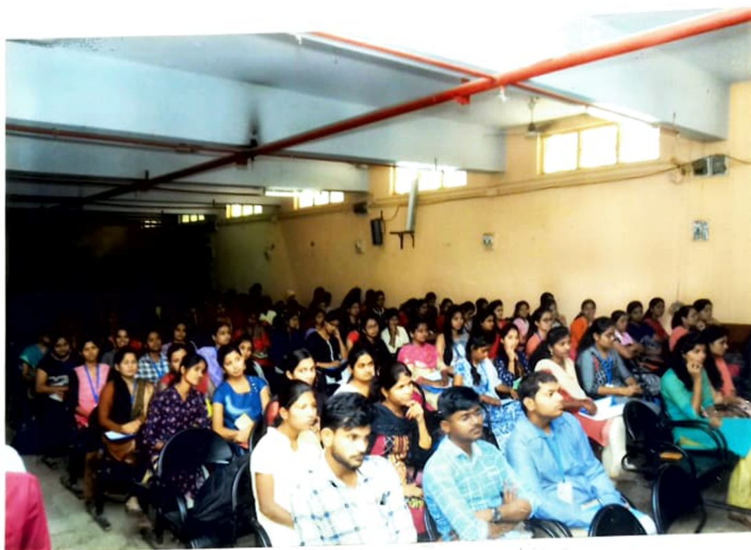
STUDENTS ATTENDING SEMINAR ON INTELLECTUAL PROPERTY RIGHTS

Appasaheb Birnale College of Pharmacy, Sangli.